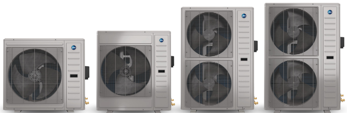
2 ton RD17AZ24AJ3NA